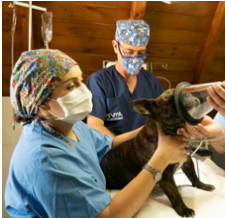
L3 Diploma in Veterinary Nursing

Many of our alumni have gone on to achieve great things after leaving college, becoming experts in their fields.