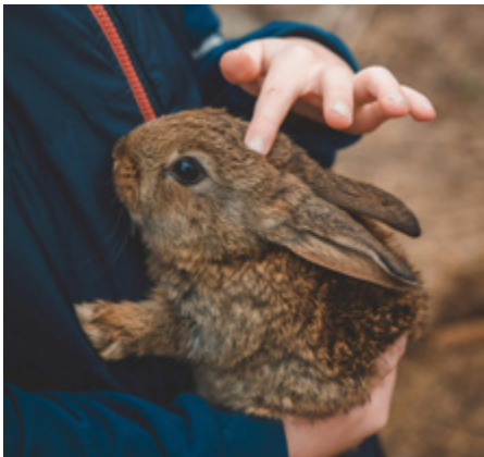
L2 Diploma for Veterinary Care Assistants

"I wanted a job that allowed me to work with animals, keep my brain engaged, take me around the world and allow me to give something back. The tutors at CAW helped consistently, they were always encouraging and helpful and brought good humour to the table!"